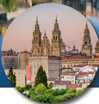
Santiago de Compostela